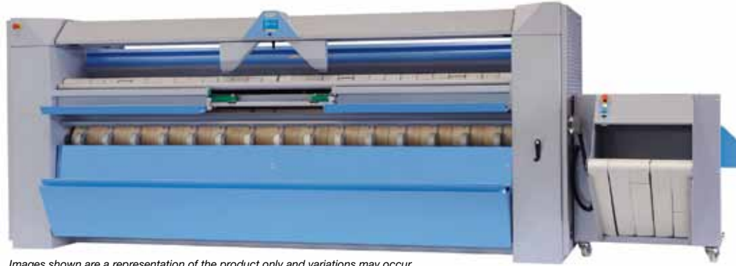
Images shown are a representation of the product only and variations may occur.