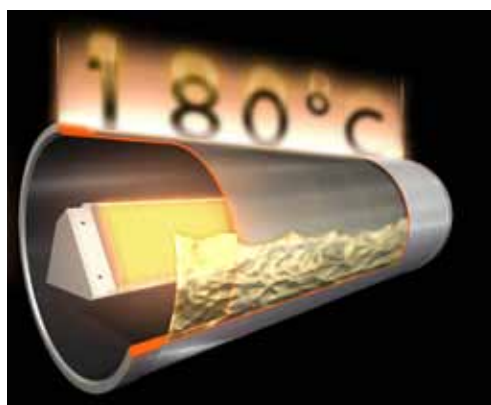
Multi-layer thermal oil Dubixium™ cylinder guarantees smooth operation at all times thanks to zero overheating of sides.

They can vary with the efficiency of the operator and are achieved with 300 mm between items at feeding.